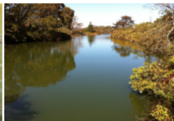
Image 3. Discolored water