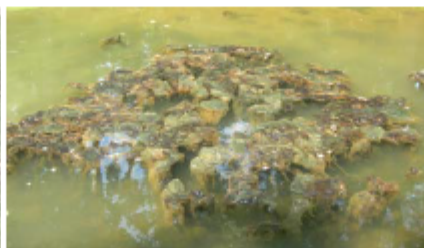
Image 2. Cyanobacteria mat