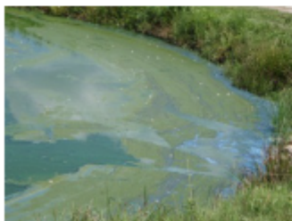
Image 1. Cyanobacteria scum

Cyanobacteria, also known as blue-green algae, are readily present in freshwaters throughout the United States. Cyanobacteria blooms often appear as bluish-green surface scums or thick mats (Images 1 and 2), although some infestations are dispersed through the water and provide slight discoloration (Image 3). With rapid growth rates under certain conditions, these organisms have the ability to achieve levels of concern in short order. Some cyanobacteria have the ability to form surface scums through buoyancy regulation and become highly concentrated in static or windblown areas of water bodies. Caution should be taken around cyanobacteria infestations to avoid exposure and resultant potential health risks.